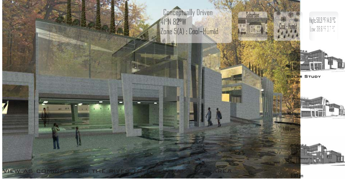
SOLAR STUDY 9:00 am