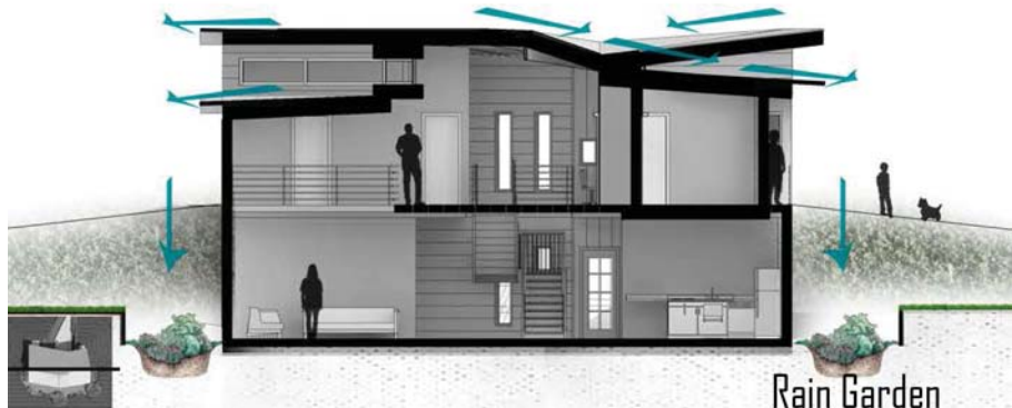
Roof angles designed to distribute water to rain gardens