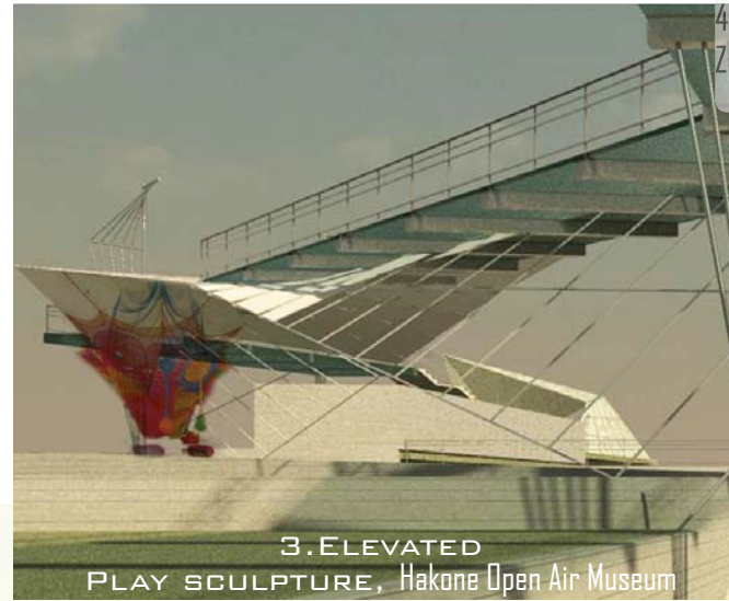
3. ELEVATED PLAY SCULPTURE, Hakone Open Air Museum