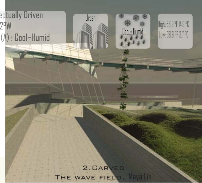
2. CARVED THE WAVE FIELD, Maya Lin

Conceptually Driven 41°N 82°W Zone 5(A) : Cool-Humid