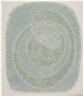
CONTINUOUS LOOP Joseph Albers / Circulation Loop