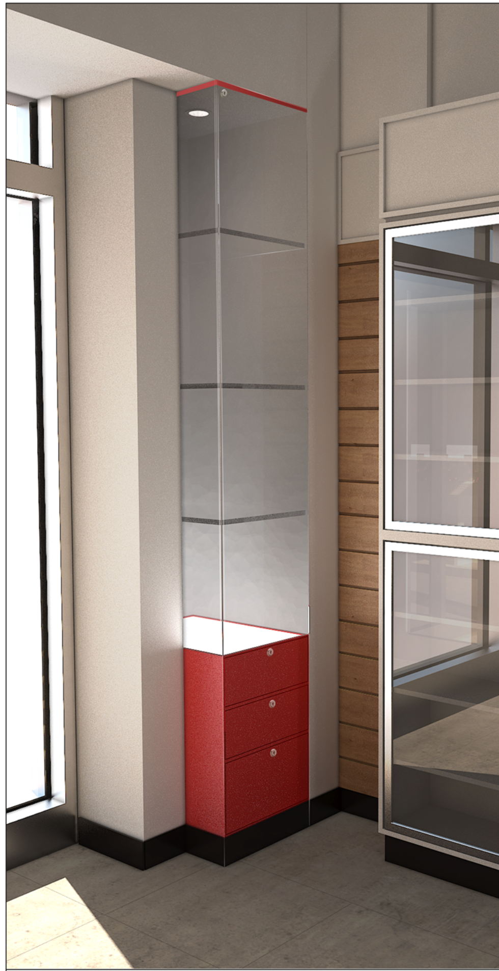
C1 - 3D VIEW SHOWING PROPOSED SHOWCASE UNIT