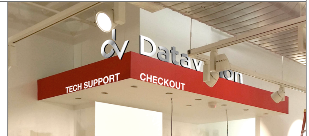
A2 - 3D VIEW SHOWING PROPOSED SIGNAGE