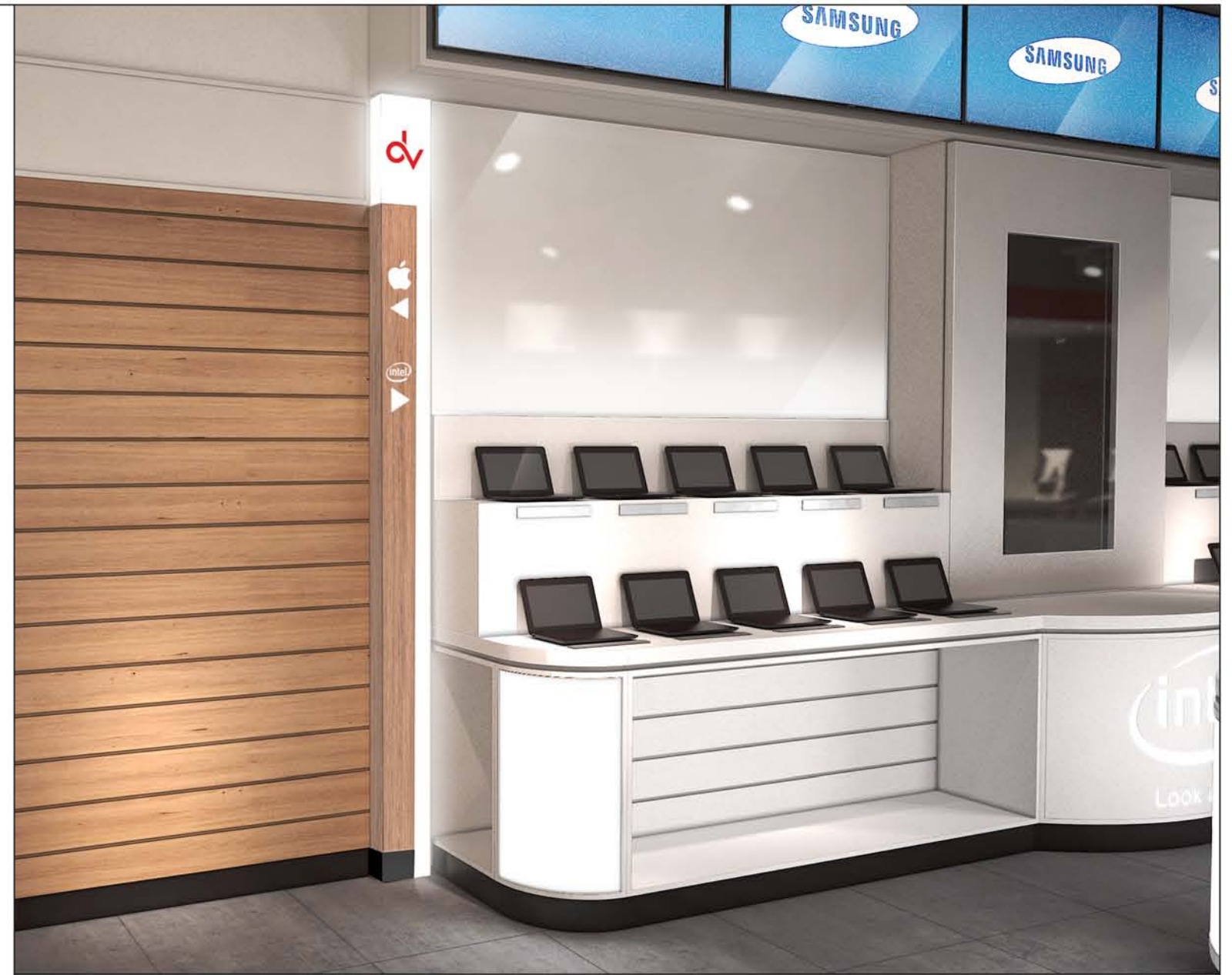
A2 - RENDERED VIEW