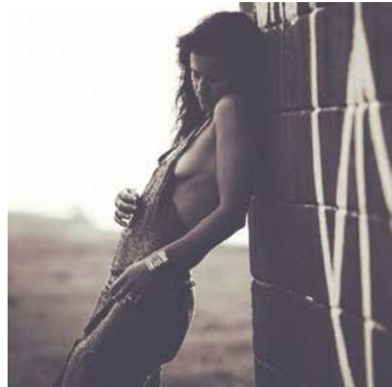
Cotton/Spandex Jersey. Razor back tank with lace jersey at back. Long scoop hem.