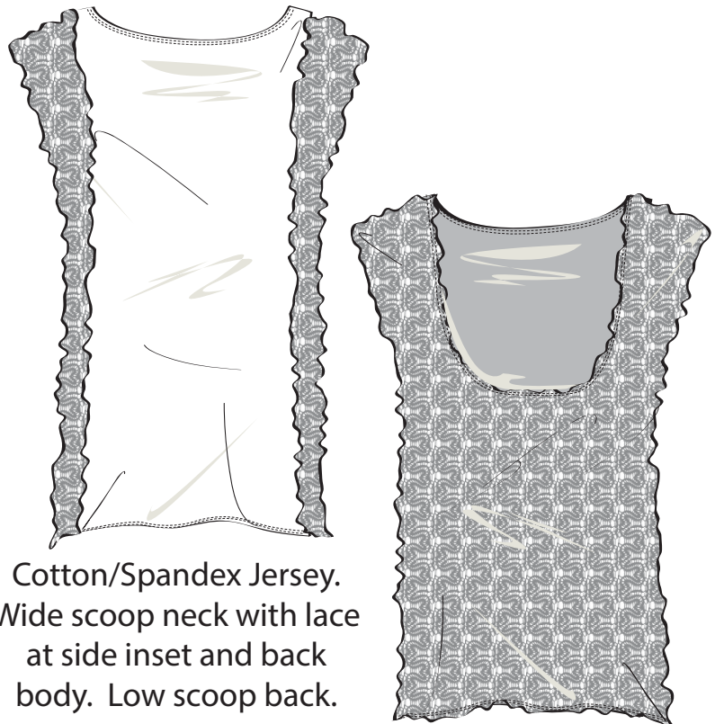
Cotton/Spandex Jersey. Wide scoop neck with lace at side inset and back body. Low scoop back.