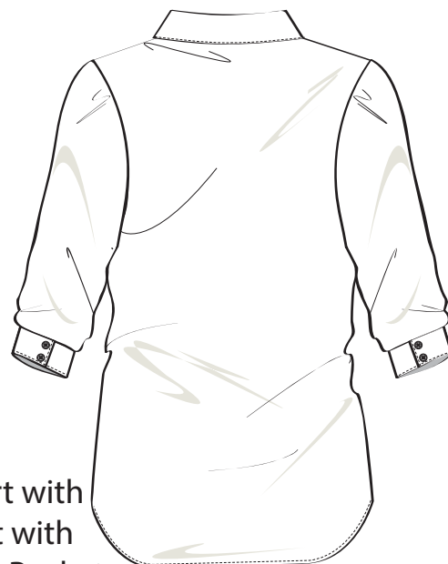
Cotton Voile. Woven 3/4 sleeve shirt with button cuff. Button placket at front with hidden snap buttons and ruffle edge. Pockets at chest with flap.