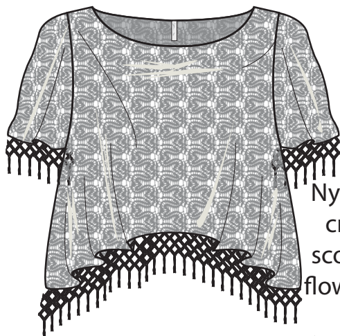
Nylon/Spandex. Lace crop top with wide scoop neck and loose flowy sleeves. Knotted fring at hem.