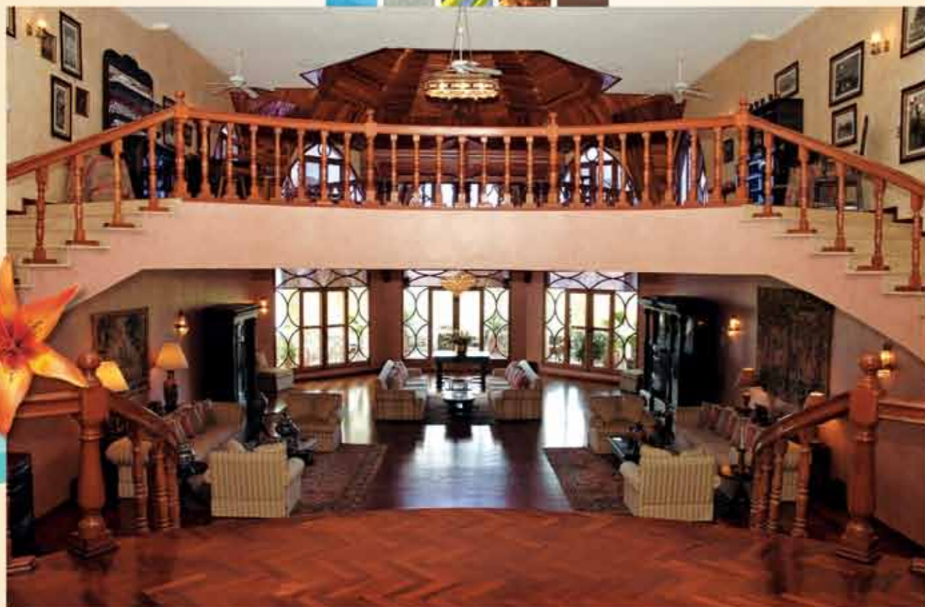
The magnificent Manor House entrance leads to a spacious 3,000 square-foot entertaining area with comfortable seating for large parties. The upper level includes a bar, pool table, and entrance to the Upper Terrace. Guest comfort is the highest priority, and El Castillo is air conditioned throughout.