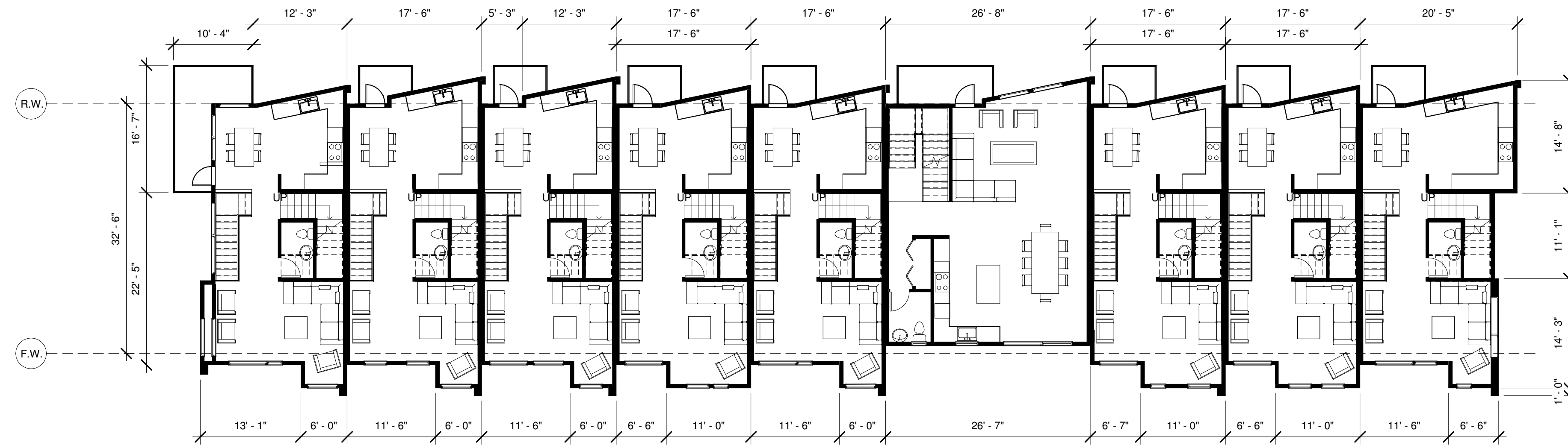
2 MOVE (A) - 2ND FLOOR SCALE: 3/32" = 1'-0"