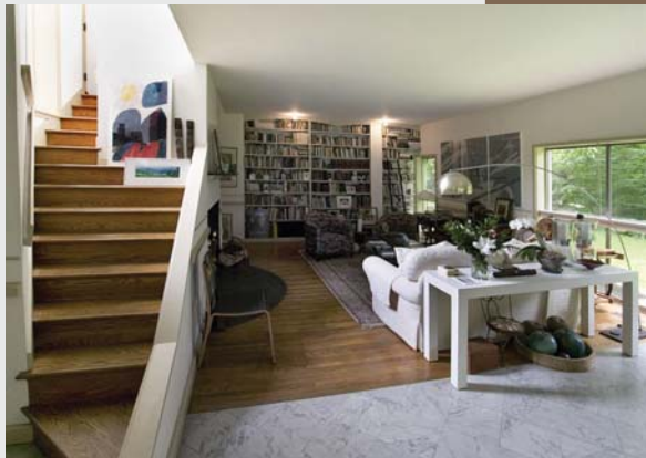
Inspiration- Venturi House

An open plan to accommodate social gatherings while also maintaining a comfortable family environment for their 2 younger children inspired this design concept. The house was given a contemporary look that maintained its warmth.