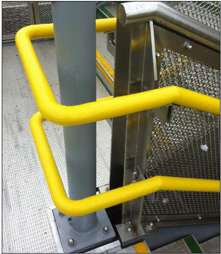
Handrail at Half Landing