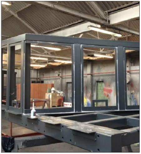
Bridge Section - Workshop