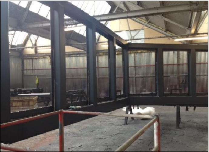
Bridge Section - Workshop