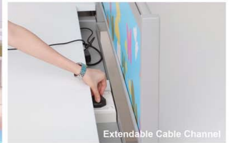
Extendable Cable Channel