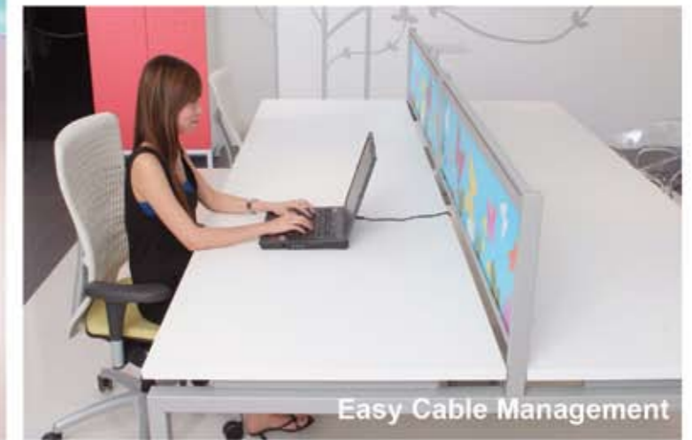
Easy Cable Management