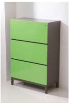
Lateral filing cabinet