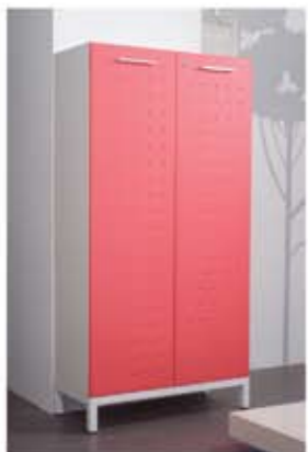
Swing door cabinet