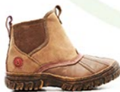
Kula $75 Chive, Tan