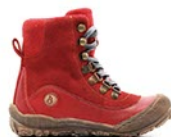
Maya K$75 Red, Black, Tan