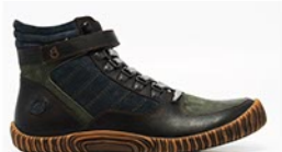
Dram $130 Red, Navy, Brown multi