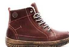
Ivana $150 Mushroom, Merlot