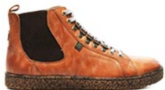
Mulholland's $150 Tan, Oxblood, Black