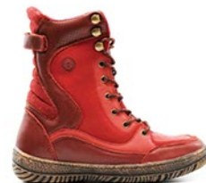
Nova $120 Chilipepper, Brown, Charcoal