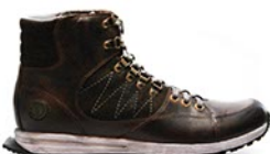
Tandem $140 Grey, Brown, Green