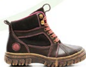
Veda $75 Grey, Brown