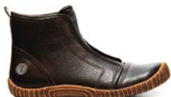
Huckleberry $130 Black, Tan, Oxblood