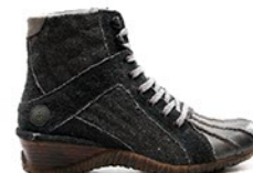
Tada Leather $145 black, brown Suede/Wool $125 Navy, Burgundy/Grey