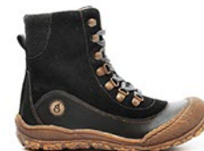
Maya $110 Black, Chilipepper, Tan