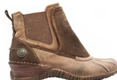
Sivan $135 Mushroom, Merlot