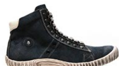
Maison $120 Black, Brown, Navy