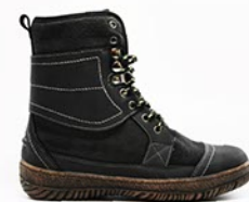
Lila $115 Camel, Black