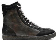
Commodore $195 Black, Brown