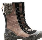
Bhati $85 Burgundy, Black