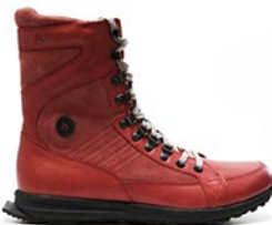
Miles $165 Grey, Red, Black