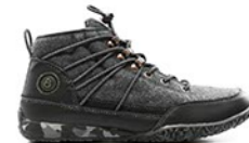
Karma $85 Black, Chilipepper