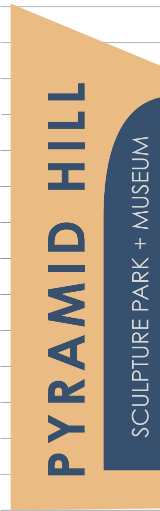
Identification: Park Entrance

KEEP LEFT ONE WAY TWO WAY CARTS ONLY NO VEHICLES DO NOT ENTER PED CROSSING