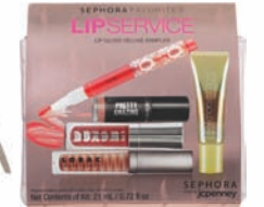
4 SEPHORA FAVORITES LIP SERVICE SET Five ways to dress up lips with juicy color and shine. $25 ($82 VALUE) Limited edition. Only at Sephora inside i.c.p.