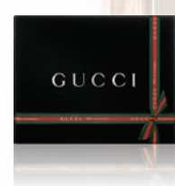
4 GUCCI GUILTY FOR HER SET Eau de Toilette and body lotion. $78 ($113 VALUE)