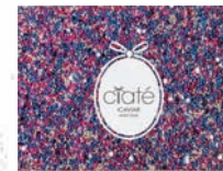
2 CIATÉ CAVIAR MINI BAR A collection for the manicure-obsessed: Four mini paint pots, and four mini caviar pearls. $29 Limited edition. Only at Sephora.