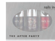
3 NAILS INC. THE AFTER PARTY SET Three brand-new glitter polishes in black, rainbow, and red. $25 Limited edition. Only at Sephora.