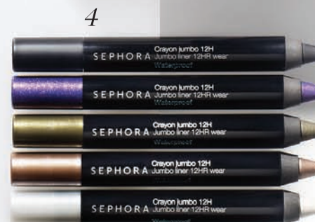
4 SEPHORA COLLECTION WATERPROOF JUMBO EYELINER SET Five liners so pigmented and thick, they double as shadows. $30 ($60 VALUE) Limited edition. Only at Sephora.