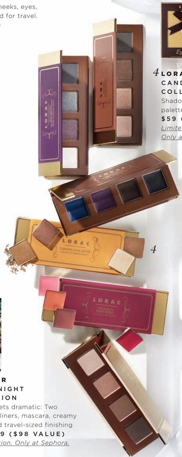
4 LORAC EYE CANDY FULL FACE COLLECTION Shadow, eyeliner, and lip palettes in a gilded box. $59 ($360 VALUE) Limited edition. Only at Sephora.