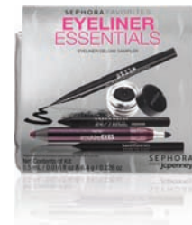
3 SEPHORA FAVORITES EYELINER ESSENTIALS SET A "who's who" of black liners in a variety of mediums: pencils, ink, and cream. $25 ($110 VALUE) Limited edition. Only at Sephora inside i.c.p.