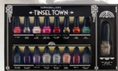
1 SEPHORA BY OPI TINSEL TOWN COLLECTOR'S SET Includes 16 mini polishes and a full-size jewel topcoat. $49.50 ($90 VALUE) Limited edition. Only at Sephora.