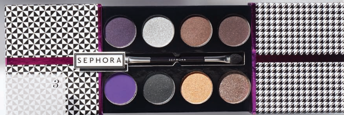
3 SEPHORA COLLECTION 3D EYESHADOW PALETTE Eight shadows for day-to-night transition, plus a double-ended applicator. $24 Limited edition. Only at Sephora.