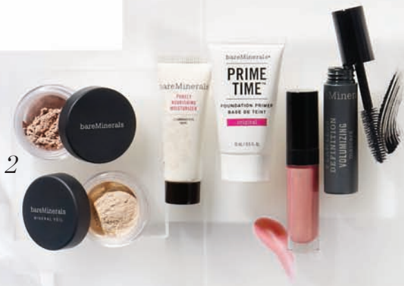
2 BAREMINERALS THE TOTAL PACKAGE SET Must-haves: primer, powder, moisturizer, and mini lip gloss and mascara. Plus, a voucher for a full-size foundation. $36 ($84 VALUE) Limited edition. Only at Sephora.