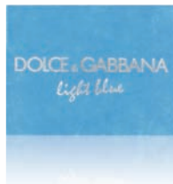
1 DOLCE & GABBANA LIGHT BLUE SET Eau de Toilette, body cr me, and travel spray. $94 ($136 VALUE)