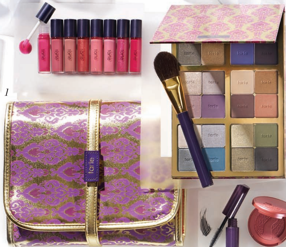
1 TARTE CARRIED AWAY WITH TARTE COLLECTOR'S SET AND ADVENTURER BAG Twenty-four shadows. Eight mini glosses. Plus: blush, powder, brush, and mini mascara. $54 ($512 VALUE) Limited edition. Only at Sephora.