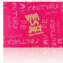
2 JUICY COUTURE VIVA LA JUICY HOLIDAY SET Eau de Toilette, body lotion, and shower gel. $75 ($110 VALUE)