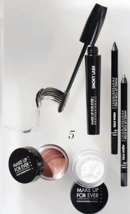
5 MAKE UP FOR EVER DAY TO NIGHT COLLECTION Demure meets dramatic: Two waterproof liners, mascara, creamy shadow, and travel-sized finishing powder. $59 ($98 VALUE) Limited edition. Only at Sephora.