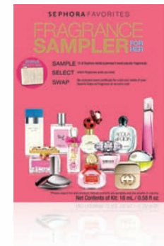
1 SEPHORA FAVORITES FRAGRANCE SAMPLER FOR HER Twelve samples of our most popular women's scents. After choosing a favorite, swap the included gift card for a full-size bottle. $50 ($98 VALUE) Limited edition. Only at Sephora inside i.c.p.