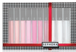
2 SEPHORA COLLECTION GLOSS LAB SET An experiment in lip color: three topcoats and seven glosses. $25 ($100 VALUE) Limited edition. Only at Sephora.