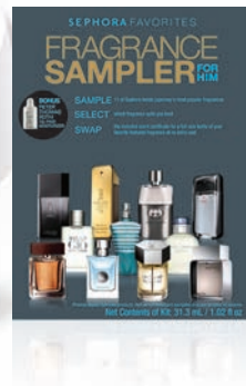
2 SEPHORA FAVORITES FRAGRANCE SAMPLER FOR HIM Pictured Left: Eleven samples of our most popular men's scents. After choosing a favorite, swap the included gift card for a full-size bottle. $50 ($105 VALUE) Limited edition. Only at Sephora inside i.c.p.