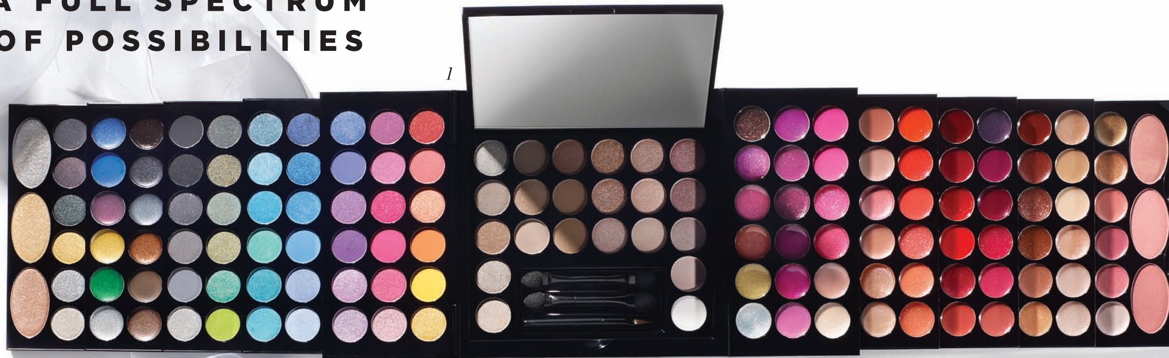
1 SEPHORA COLLECTION COLOR DAZE BLOCKBUSTER Includes 148 formulas, finishes, and textures for eyes, lips, and cheeks. $49.50 ($370 VALUE) Limited edition. Only at Sephora.