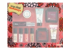
3 BENEFIT SEXY LITTLE STOWAWAYS 10 bestsellers for lips, cheeks, eyes, and face—perfectly sized for travel. $34 ($106 VALUE) Limited edition.