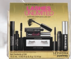
5 SEPHORA FAVORITES LASHES UNLIMITED SET Includes six mini mascaras and false lashes. $25 ($73 VALUE) Limited edition. Only at Sephora inside i.c.p.