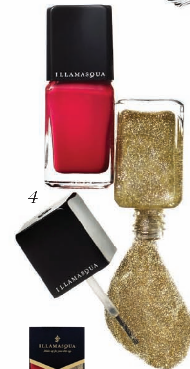
4 ILLAMASQUA NAIL VARNISH DUO Opulent, high-pigment shades of Spartan and Throb. $25 Limited edition. Only at Sephora.