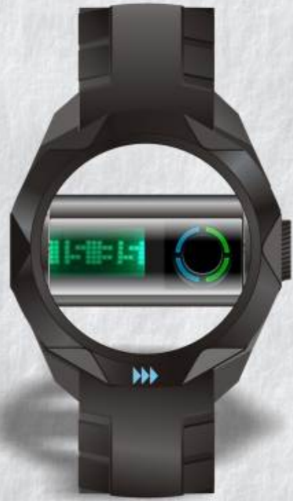
front view - digital display