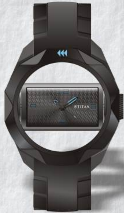
front view - analog display