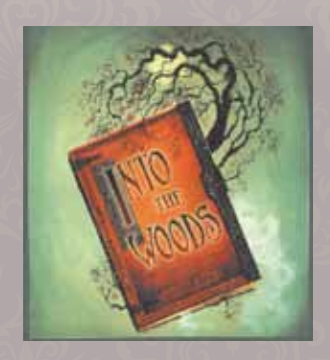
May 31 - June 29

In this fractured fairytale, a Baker and his Wife swindle, lie, and steal from Cinderella, Rapunzel, and Little Red Riding Hood in order to break the Witch's spell.