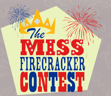
April 26 -May 12

From the author of Crimes of The Heart : Carnelle hopes to restore her dignity by winning Brookhaven, Mississippi's famous pageant. The arrival of her recently released brother and snobbish cousin turns the family homestead upside down.