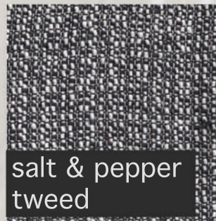
salt & pepper tweed