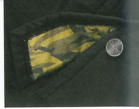
Inset details L to R: Truck Co. embroidery at front waist. Custom zipper pull. Lined with brushed truck silhouette camo flannel. Lower right interior hidden pocket with zip closure. Large front waist pockets with camo lining and custom tack button closure.