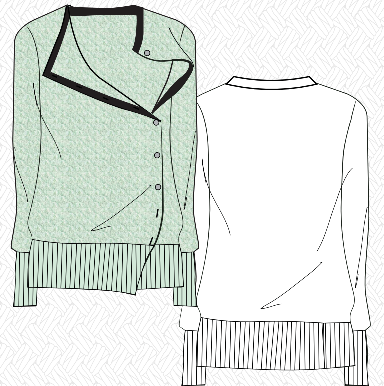
Style # AHN0422-W03