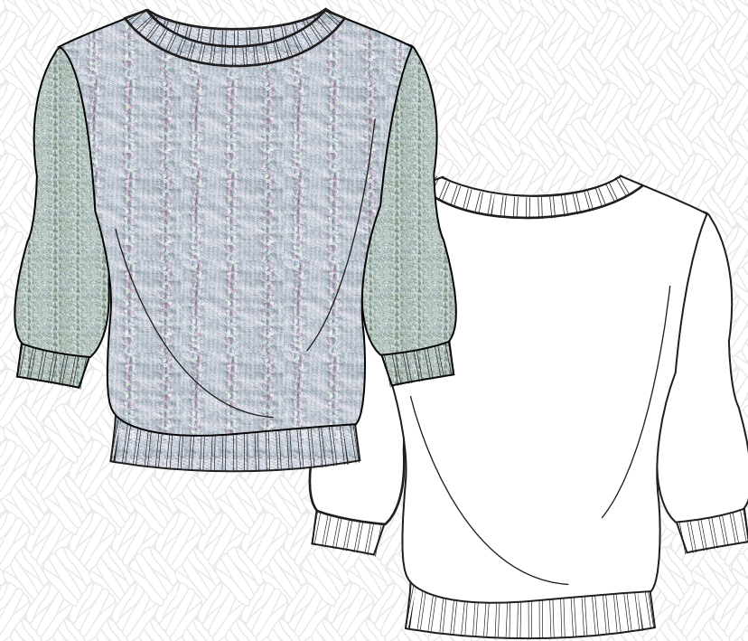
Style # AHN0422-W01