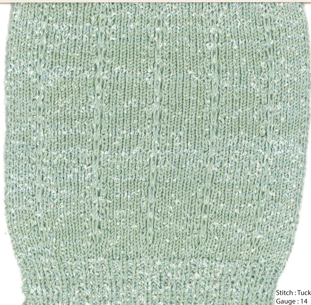
Stitch : Tuck Gauge : 14 Yarn type : 4-ply yarn Content : cotton/polyester

Womens wear Spring Summer 2014 Emphasized on stitches