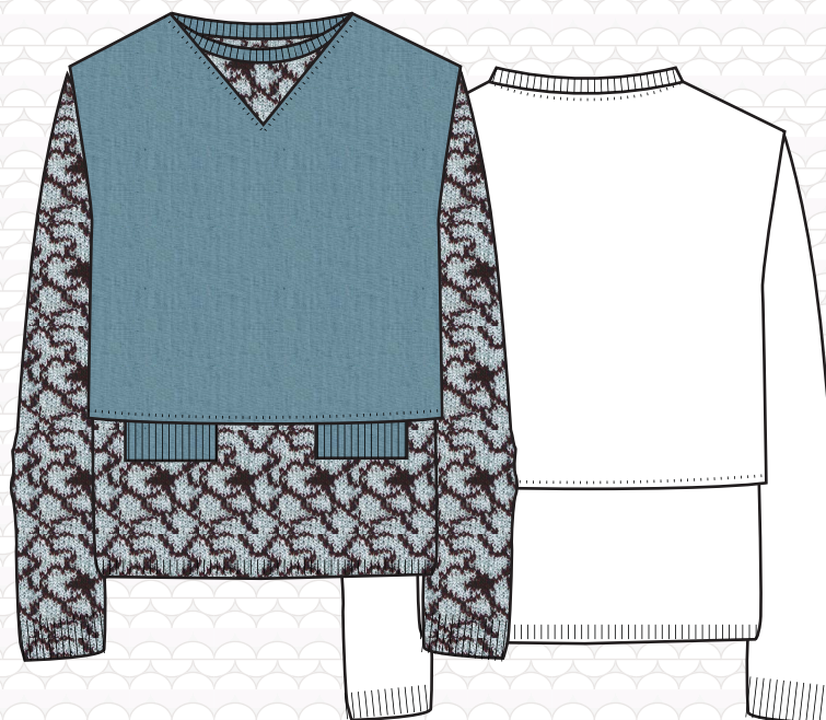
Style # AHN0422-M06