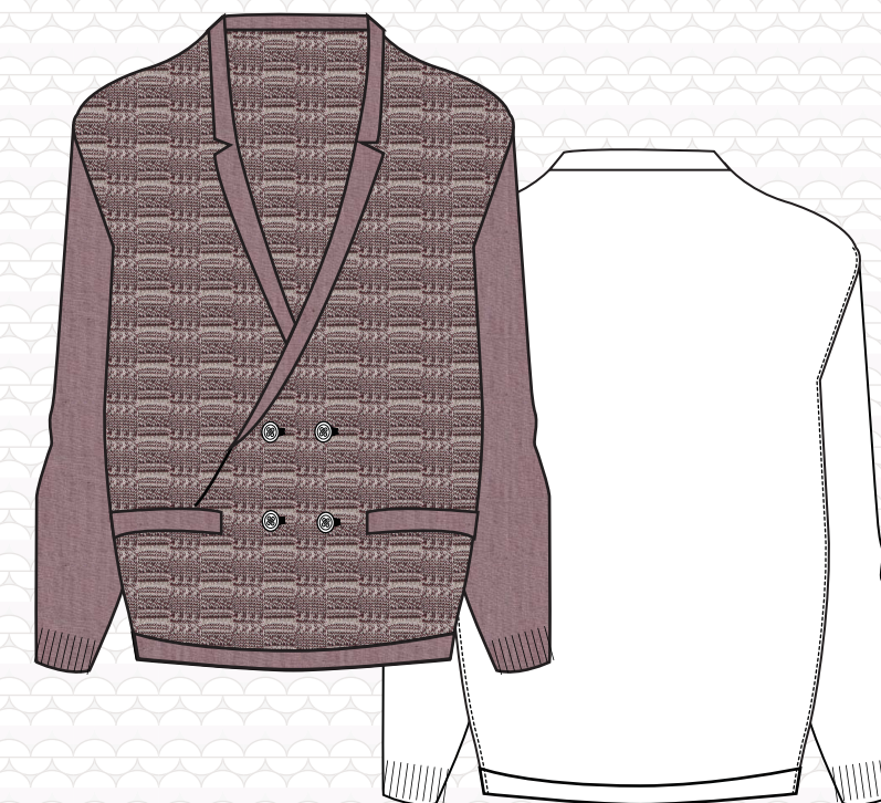
Style # AHN0422-M07