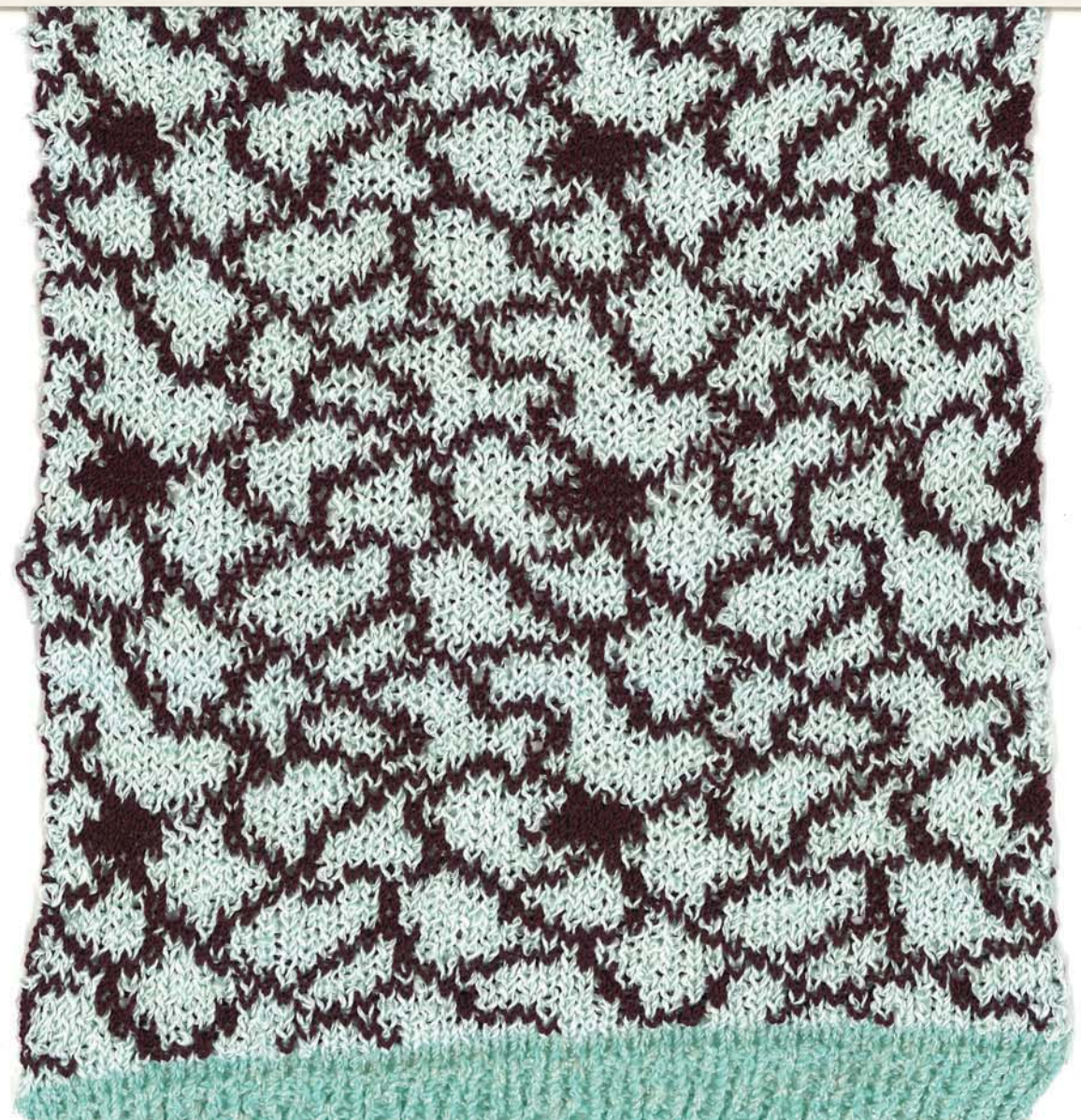
Stitch : 2C Jacquard Gauge : 14 Yarn type : 2-ply yarn Content : poly/nylon

" Refresh " Menss wear Spring Summer 2014 Emphasized on patterns