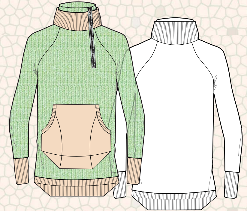
Style # ES_M_03