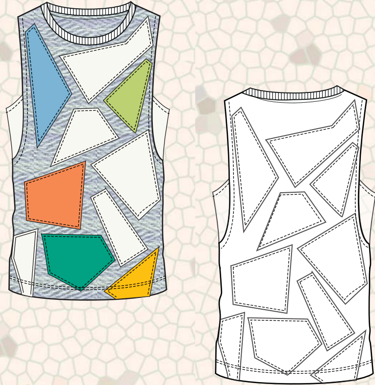
Style # ES_M_01