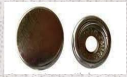
36L Metal Button Metal