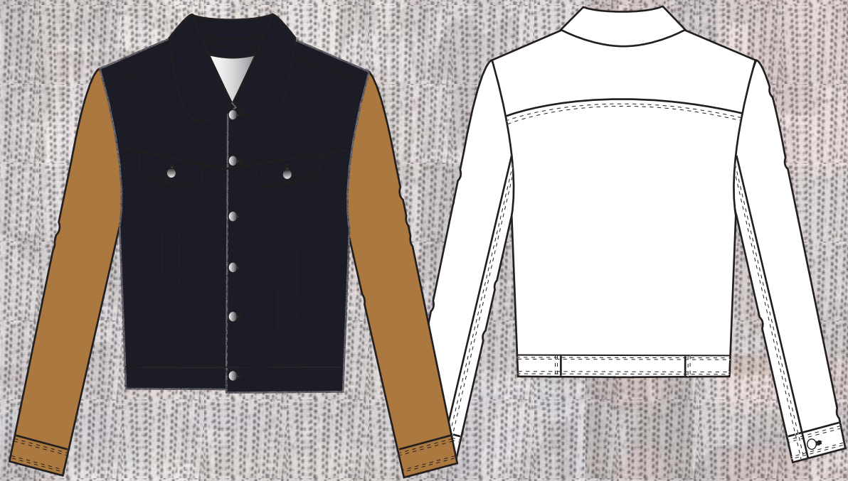
Style # AHN005 Retro Jacket $ 380.00