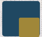
Blue Coral/ Mustard