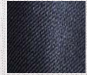
Gabardine 80% Cotton 20% Wool