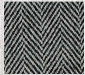
Herringbone 70% Wool, 19% Nylon 9% Acrylic