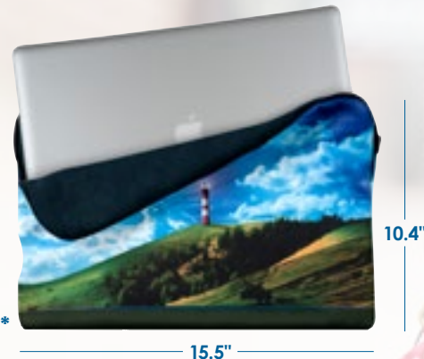
EXTRA LARGE* TOY-EZP4 Great for use with 17" laptops and other valuables

The Smart Pouch Zip features unprecedented customization options delivering dynamic presentation with a vibrant full-color, full-bleed imprint that will make brands shine while providing storage for electronics, toiletries and other valuables. Made of 100% dual-sided microfiber, its silky exterior delivers the foundation for brand messaging and is great for polishing while its color customizable plush interior doubles as a means for cleaning valuables. Strengthen brand connections with Toddy Gear's one-of-a-kind, fully customizable Smart Pouch Zip.