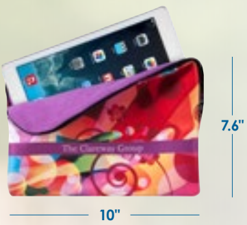
MEDIUM* TOY - EZP1 Great for use with tablets and other valuables