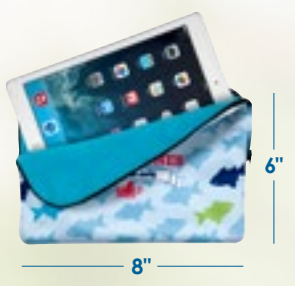
SMALL* TOY-EZP1 Great for use with mini tablets and other valuables