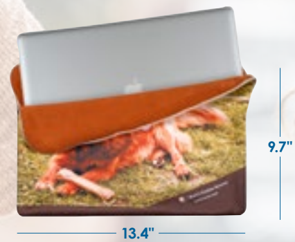
LARGE* TOY-EZP3 Great for use with 12"-15" laptops and other valuables