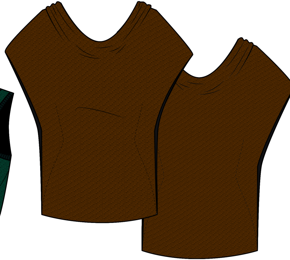
OTB605 Kimono Sweater 50% Cashmere 50% Cotton Knit