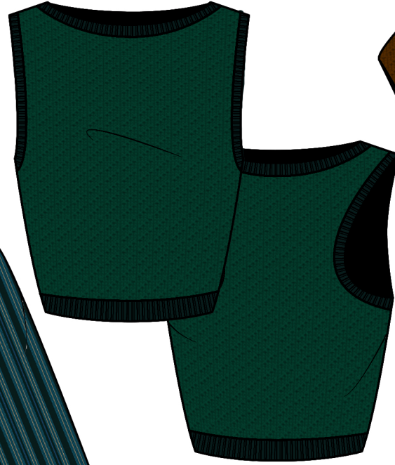
OTB611 Sweater Vest 50% Cashmere 50% Cotton Knit