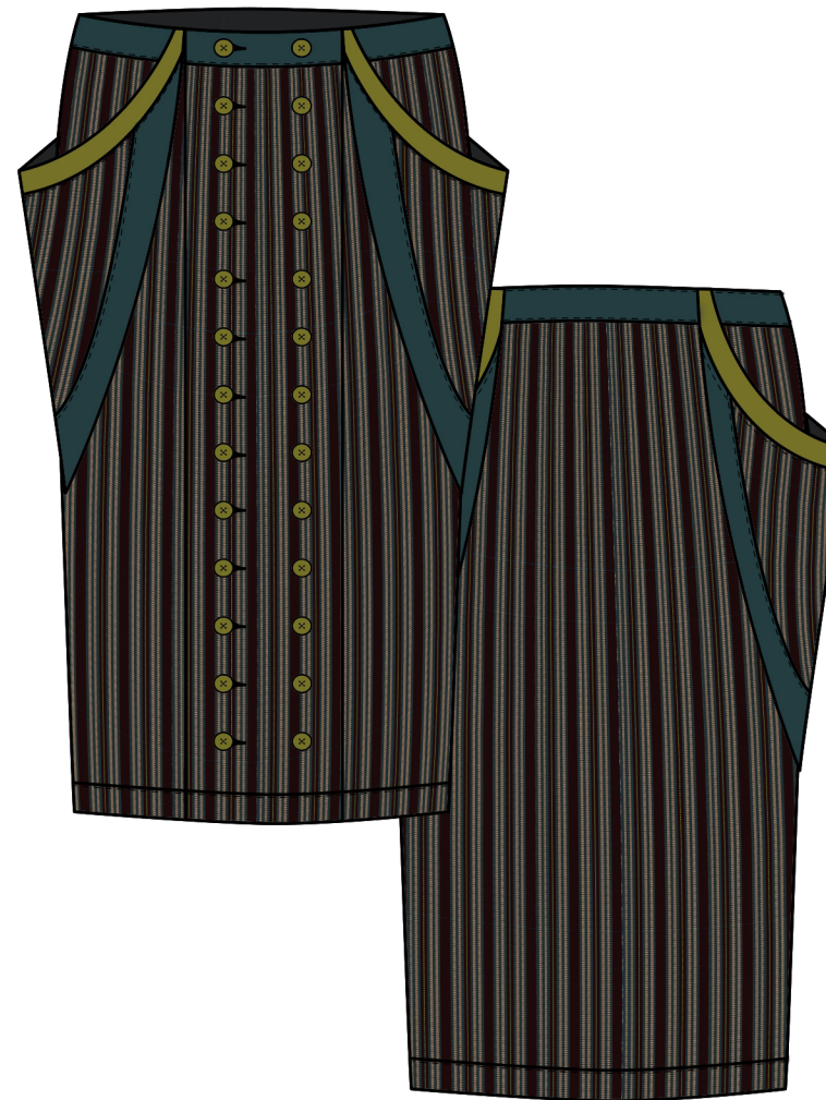
OTB623 Button Down Skirt 30% Cashmere 70% Cotton Woven