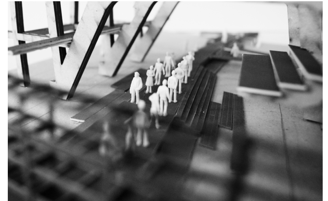
Sections in relation to interior catwalk.