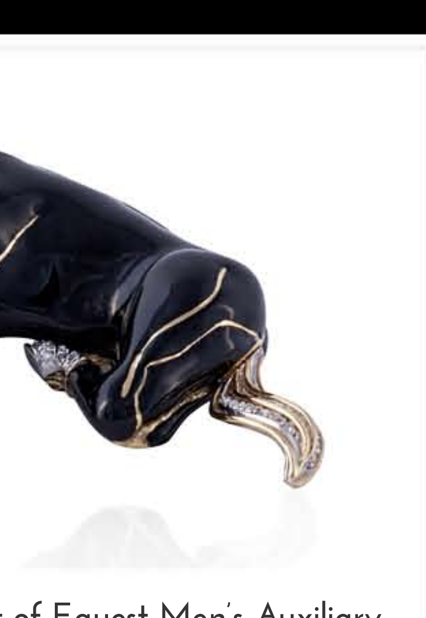
Photo: Highland Park Village Tailor & Alterations

Highland Park Tailor & Alterations 30 Highland Park Village 214.384.4129