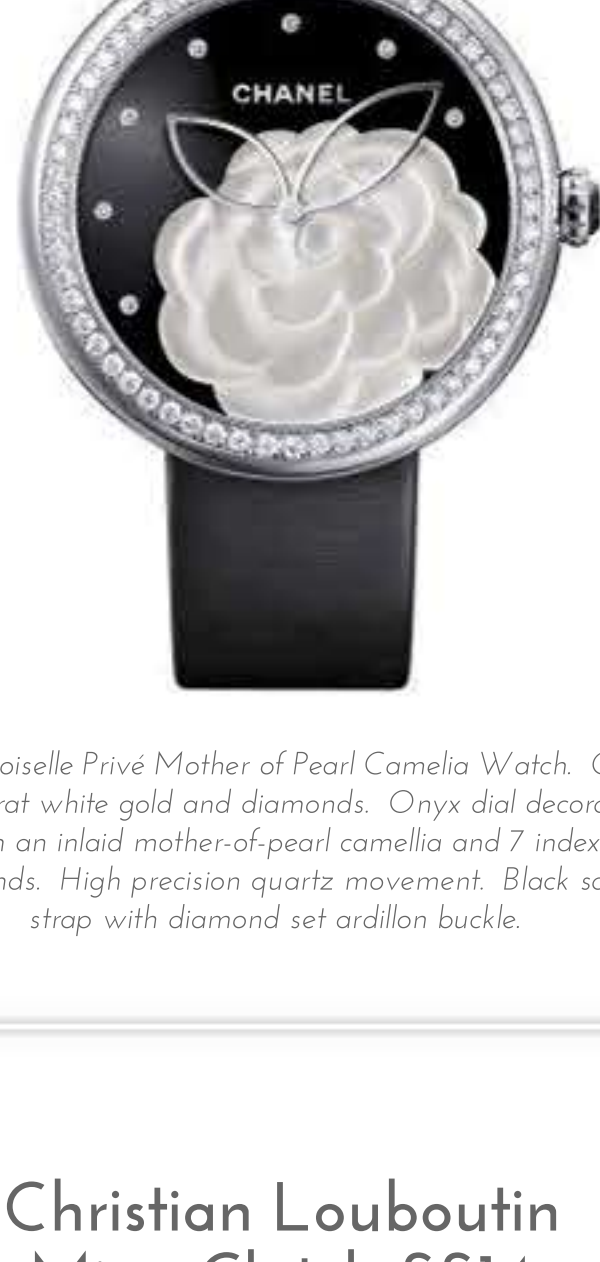
Mademoiselle Privé Mother of Pearl Camellia Watch. Case in 18 carat white gold and diamonds. Onyx dial decorated with an inlaid mother-of-pearl camellia and 7 index diamonds. High precision quartz movement. Black satin strap with diamond set arillon buckle.