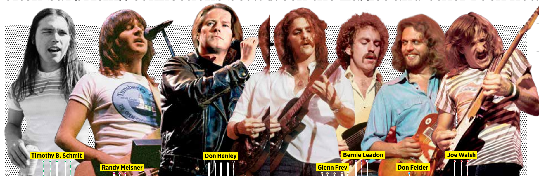
Timothy B. Schmit

Before joining the Eagles, Felder played lead guitar on tour with this duo (even earlier, he played in a high school band with pre-CSNY Stephen Stills in Florida).