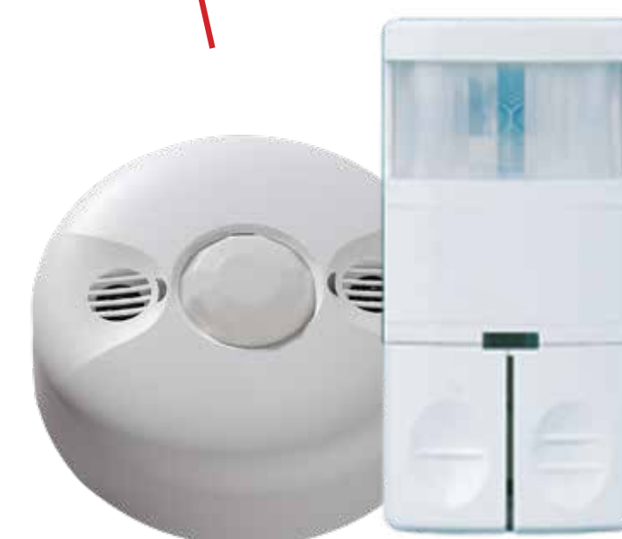
Occupancy and Vacancy Sensors Light hallways, offices, conference rooms storage areas, and restrooms as needed