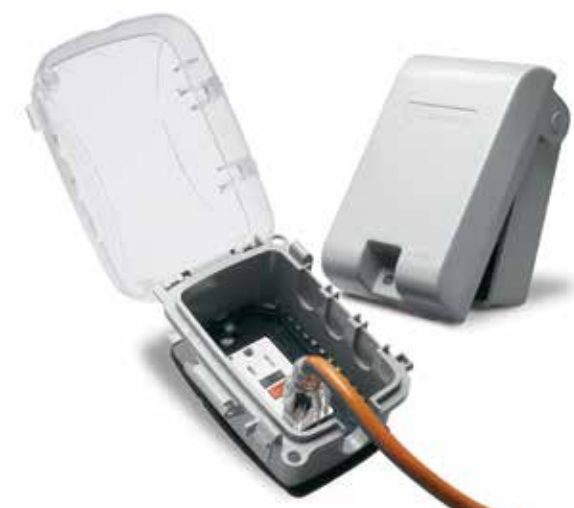
Weatherproof Covers Protect exterior outlets and interior outlets in wet areas with the most versatile and durable covers on the market