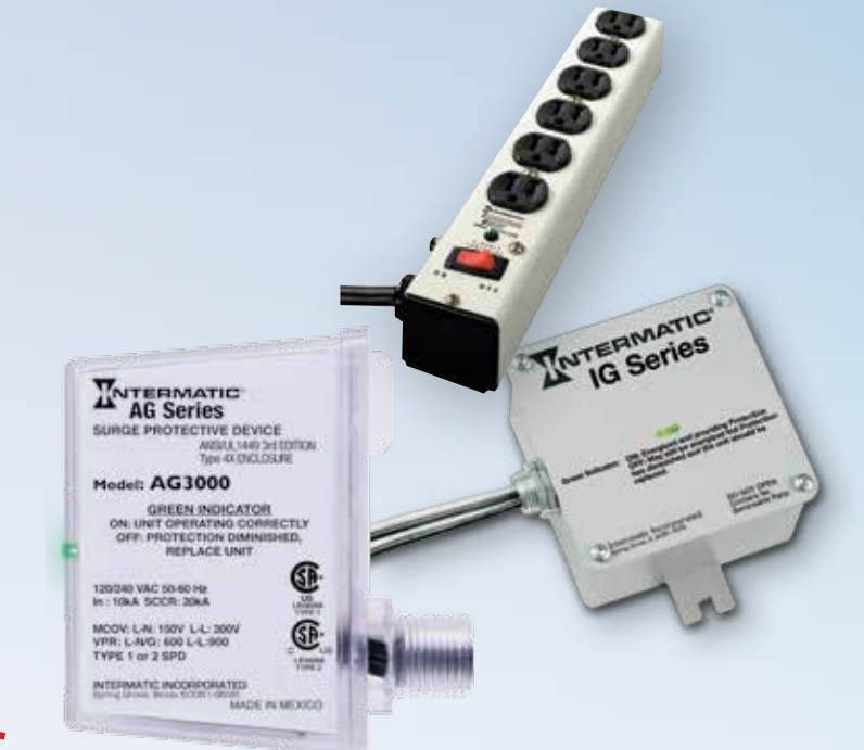
Surge Protection The reliable, affordable protection for valuable equipment