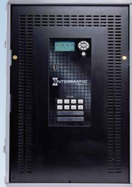
Advanced Controls Advanced lighting control for Interior/Exterior lighting and motor loads with PC app