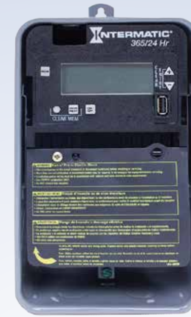
Electronic Controls Electronic time controller for interior/exterior lighting