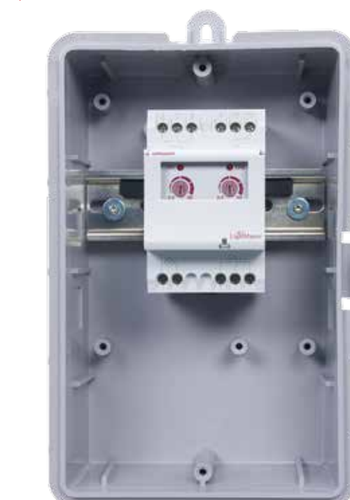
Lightmaster™ Series Daylight control delivers additional savings