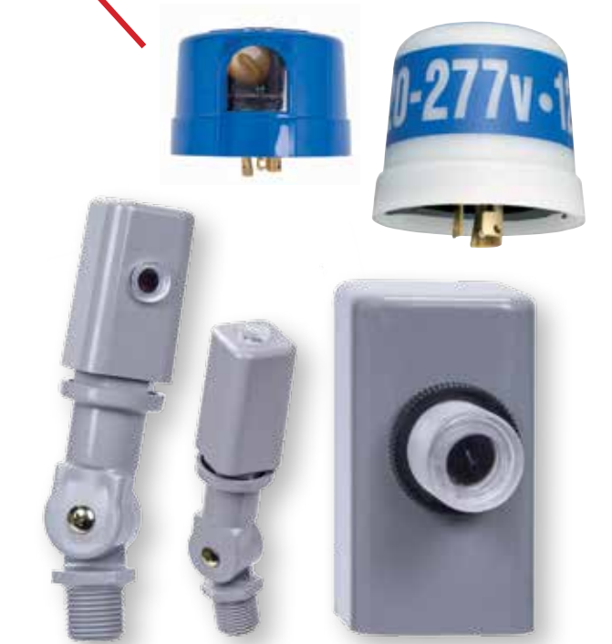
Electronic Photocontrols The long life solution for exterior LED Lighting fixtures