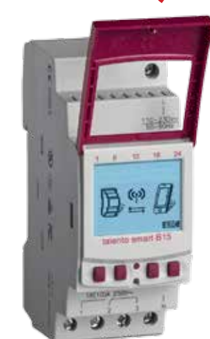
talento smart Time switch for programming of your lighting systems with a mobile app