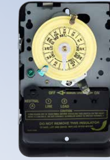
Mechanical Controls The most basic, easy to use lighting/load control