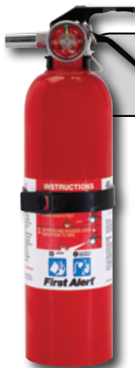
FE5GO Recreation Fire Extinguisher