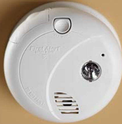
SA720CN Smoke Alarm with Escape Light