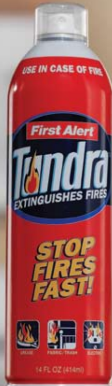
AF400 Tundra Fire Extinguisher Spray