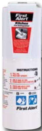
KFE2S5 Kitchen Fire Extinguisher