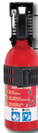
FESA5 Auto Fire Extinguisher