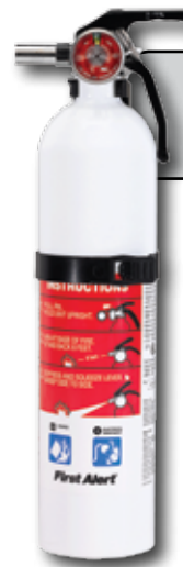
FE10GO Garage Fire Extinguisher