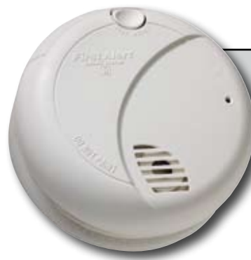
SA710CN Smoke Alarm with Silence