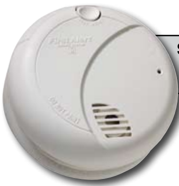
SA710LCN Smoke Alarm with Lithium Battery