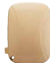
Color Weatherproof Covers