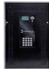
365-Day Advanced Energy Controls