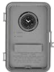
Auto-Voltage Defrost Timers