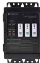
Surge Protective Device with Consumable Modules