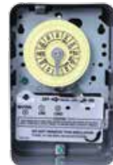
Mechanical Time Switches