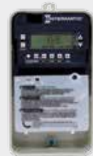
Seasonal Adjustment Timers