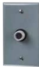
LED Photo Controls