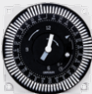
Panel Mount Timers