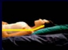
Ordinary flat pillow.