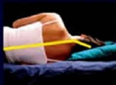
Ordinary flat pillow.