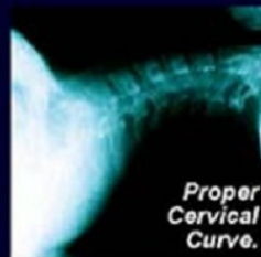
Proper Cervical Curve.