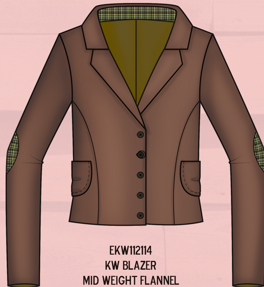
EKW112114 KW BLAZER MID WEIGHT FLANNEL CONTRAST ELBOW PATCHES 75% VIRGIN FLEECEWOOD, 25% POLYAMIDE LINING: 60% ACETATE, 40% BEMBERG