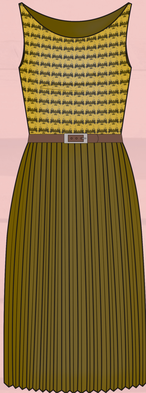
EKW112113 TAKE ME OUT DRESS PLEATED SKIRT INVISIBLE SIDE ZIPPER 100% VISCOSE VOILE BELT : GENUINE LEATHER