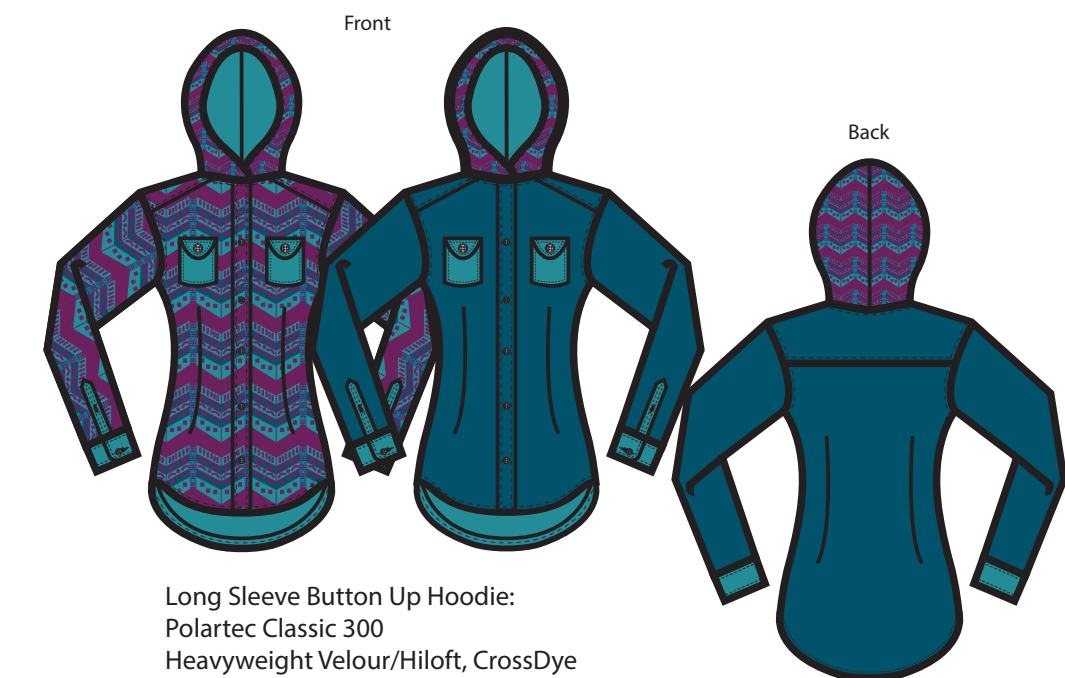
Long Sleeve Button Up Hoodie: Polartec Classic 300 Heavyweight Velour/Hiloft, CrossDye 100% Polyester