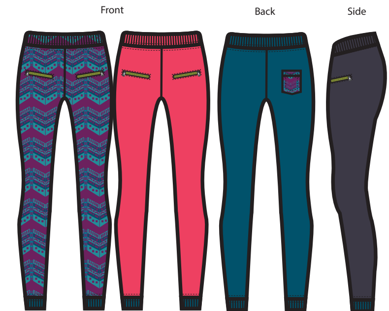
Leggings: Polartec Power Stretch Hard Face Jersey/Velour/DWR/Recycled 88% Polyester, 12% Lycra