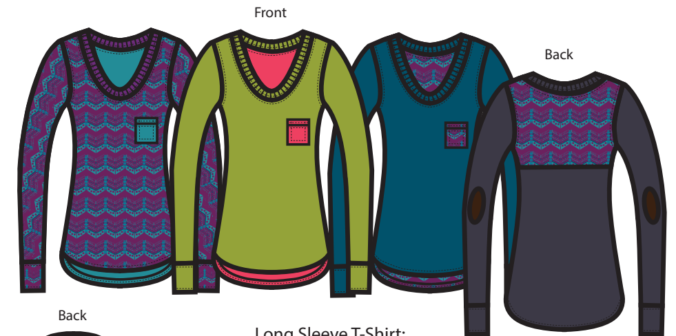
Long Sleeve T-Shirt: Polartec Power Dry MidWeight Textured, Recycled 100% Polyester