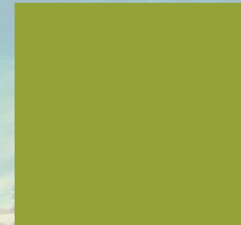
NATURE GREEN P 160-8U