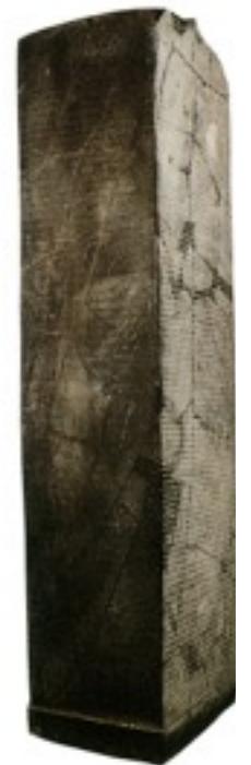
Source 6.6 The Sdok Kak Thom stele, currently in the National Museum of Bangkok