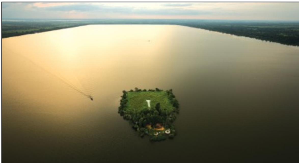
Source 6.4 West Baray, the largest baray in Cambodia, located at Angkor/Yasodharapura; building began in the 11th century under King Suryavarman I and was modified later under King Udayadityavarman II who raised the dykes around it and built an island in the middle

The first feature was the building of massive reservoirs of water known as barays . Indravarman I's baray , known as the Indratataka (Sea of Indra), was 3.8 kilometres long and 800 metres wide, and was able to hold up to 7.5 million cubic metres of water, which is approximately the volume of 2270 Olympic swimming pools. Historians believe that there were a number of reasons why kings carried out these irrigation works. One was that, through providing a water source in the form of the barays , kings were able to honour both their subjects and the local water divinities. Another was that by building these enormous reservoirs, kings were demonstrating their power and their closeness to the gods by creating earthly representations of the lakes that surrounded Mount Meru, the real but undiscovered home of their Hindu gods.