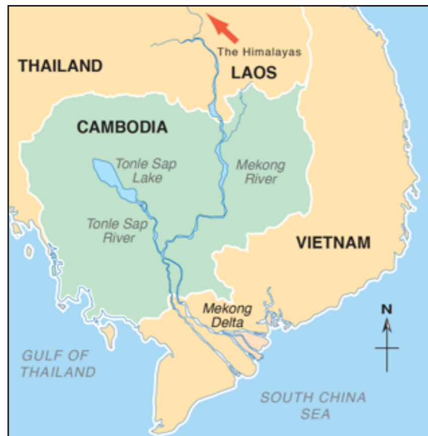
Source 6.2 Cambodia and surrounding countries, showing the Tonle Sap Lake, Tonle Sap River, Mekong River and Mekong Delta

The coastal trading societies comprised the Malay people and centred on the island of Sumatra, the Malaysian Peninsula and the Straits of Malacca, which is the body of water that separates Sumatra and Malaysia. Malay people also settled along the coast of present-day central Vietnam, where they were known as the Chams and their kingdoms known as Champa.