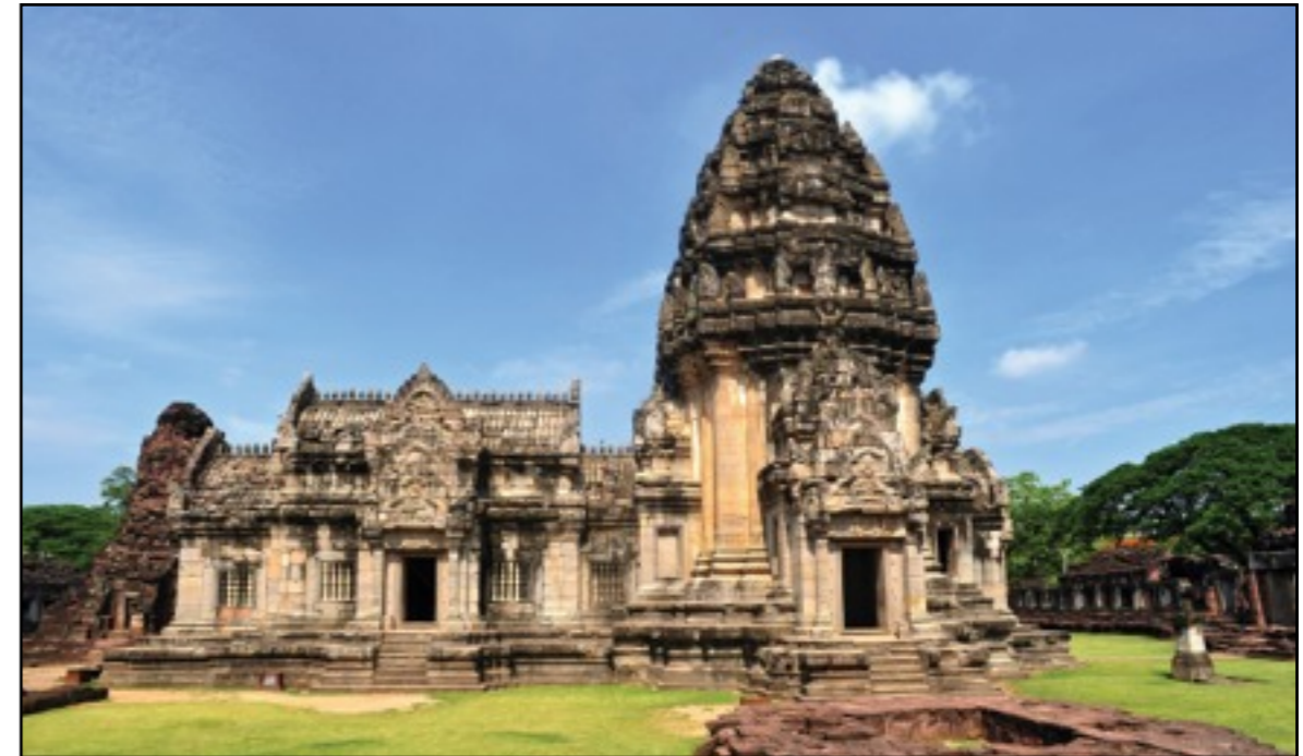
Source 6.12 Part of the temple Phimai

Hindus believe that the gods live on a mountain called Mount Meru. They believe that the mountain is in the Himalayas, but its location had not been discovered. The religion states that Mount Meru is surrounded by seven different seas, from which springs the river Ganges. As its source is connected to the home of the gods, Hindus believe the waters of the Ganges are pure and the river is therefore viewed as a holy place. As we have learned, the temples that the Khmers built, especially those known as temple mounts, were representations of Mount Meru. As this type of temple was associated with the Khmer