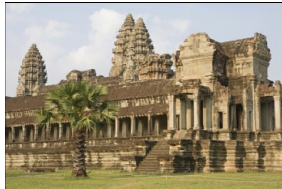
Source 6.5 Angkor Wat

Temple mounts and barays used extensive amounts of water and required the construction of canals and dykes. These engineering features displayed the king's power and success as a ruler, because extraordinary resources of labour were required to build them.