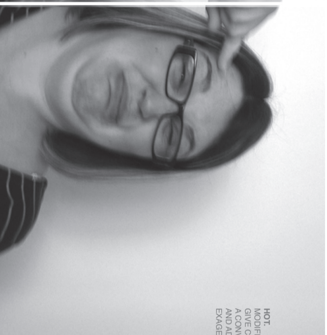
HOT. MODIFIED TO GIVE CONTEXT TO A CONVERSATION AND ADAPTING TO EXAGGERATIONS.