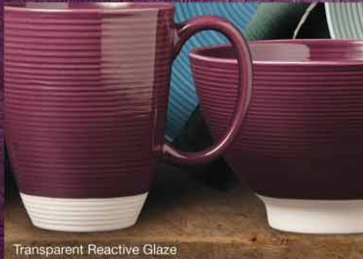
Transparent Reactive Glaze