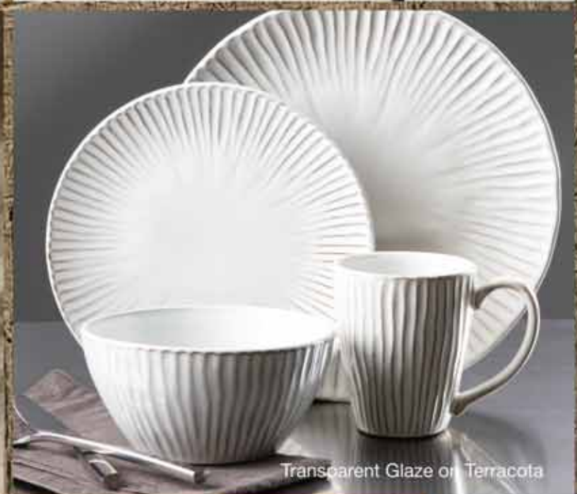
Transparent Glaze on Terracota