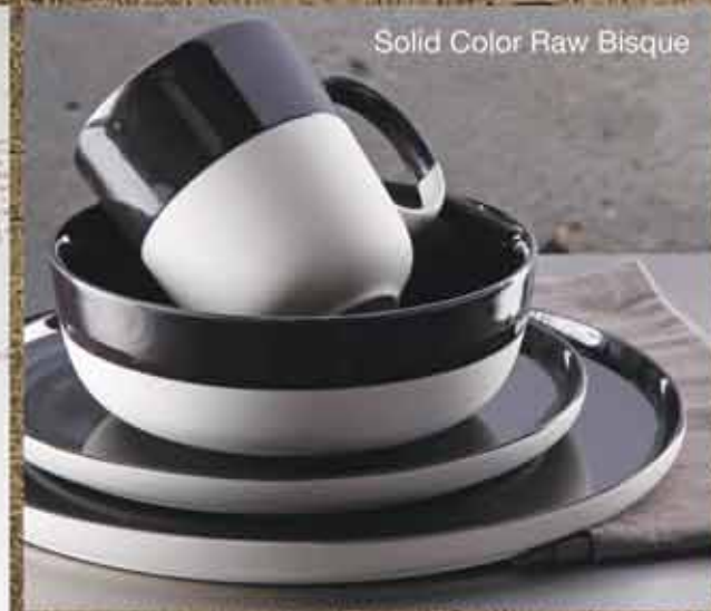
Solid Color Raw Bisque