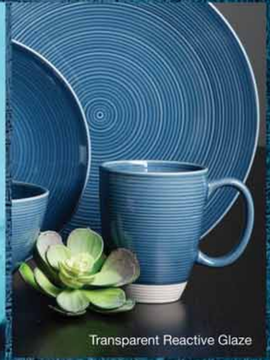
Transparent Reactive Glaze