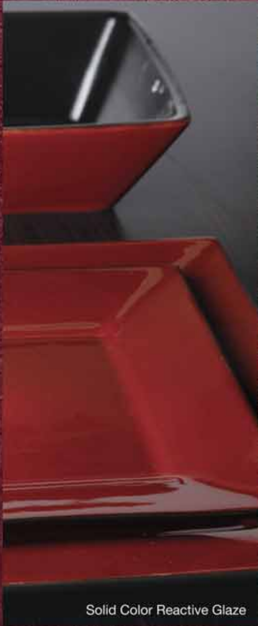
Solid Color Reactive Glaze