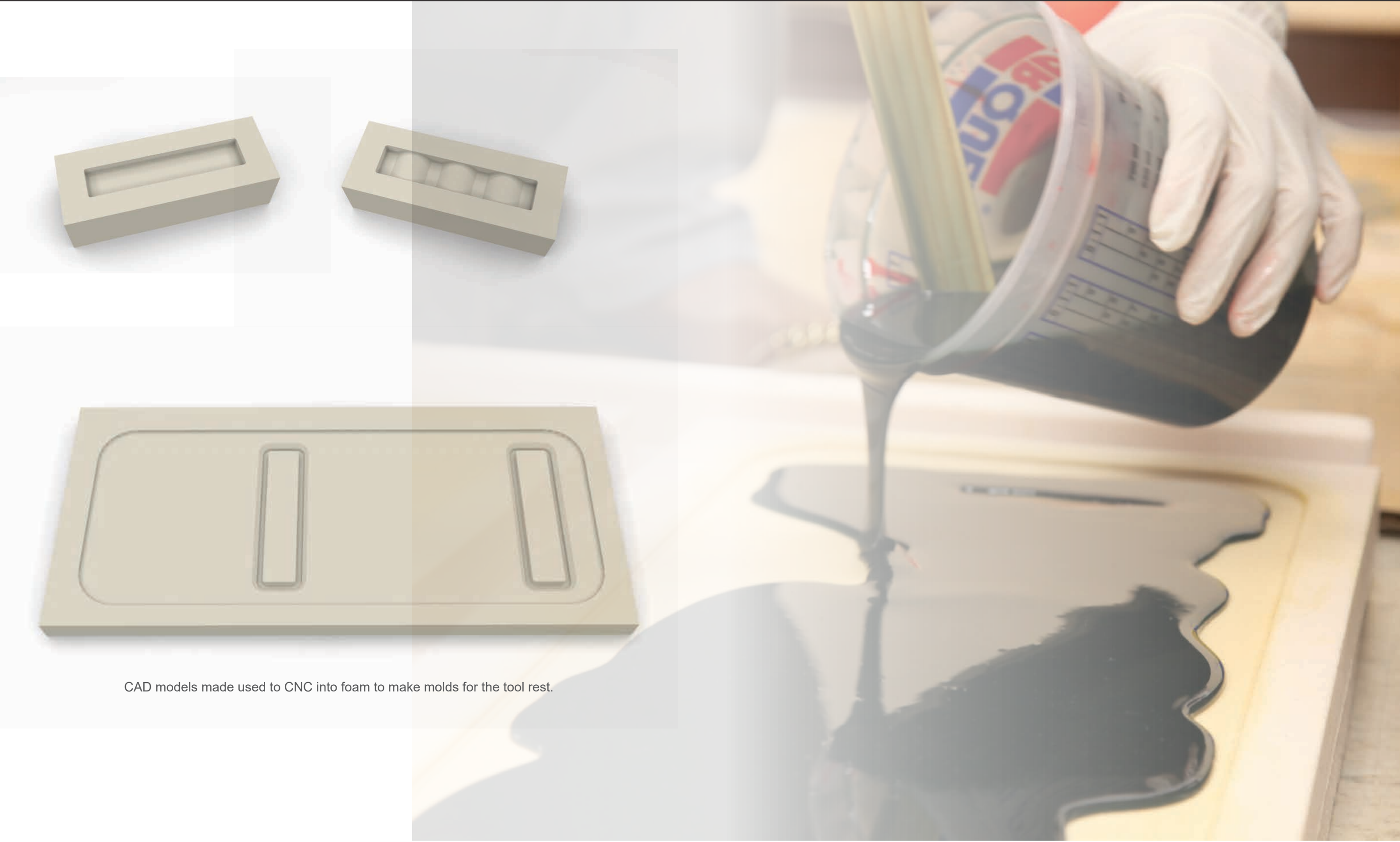
CAD models made used to CNC into foam to make molds for the tool rest.