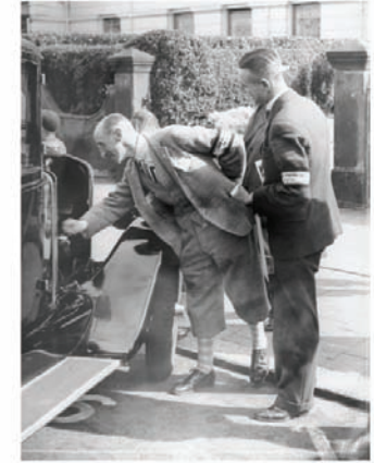
A judge inspecting a car at the Southport Rally, 1928. Artist: Unknown