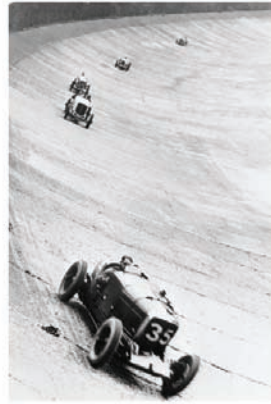
Bentley 6.5 litre, 500 Mile Race, Brooklands, Surrey, 1929. Artist: Unknown