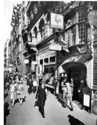
Ye Old Cock Tavern, Fleet Street, City of London, early 1920s. Artist: Unknown