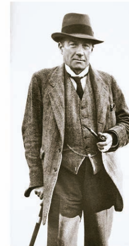
Stanley Baldwin, British Conservative politician, 1924.