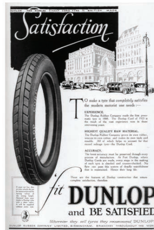
Dunlop advertisement, 1923.