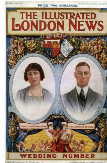
Front cover of "The Illustrated London News Wedding Number", 28th April 1923.