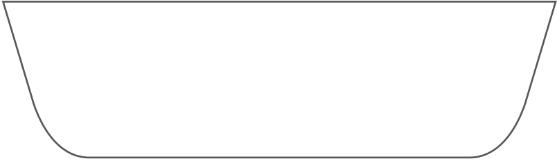
CUT OUT DETAIL – ACTUAL SIZE/SHAPE