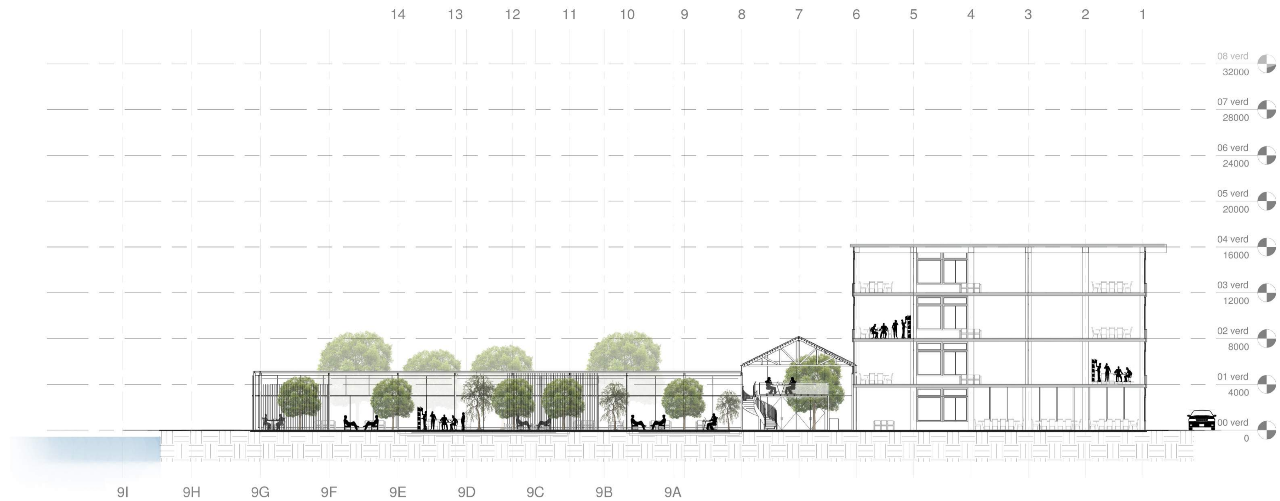
3 Doorsnede CC 1 : 200