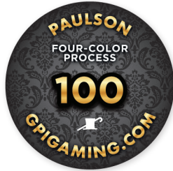
Super Grand Inlay