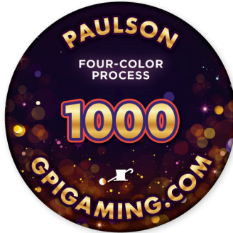
Super Giant Inlay