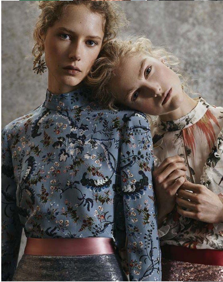
TRENDING COLORS deep green, metallics (silver/bronze), warm taupe, cool grey, & navy blue.