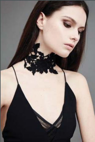
CHOKER velvet & lace are popular materials. leather chokers with large pendants in a round shape are trending.