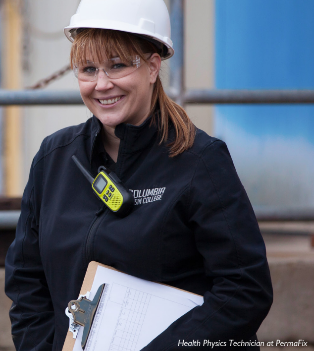
Health Physics Technician at PermaFix

Nuclear Technology Radiation Protection Technician Graduate